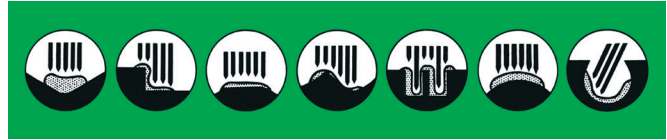
Fig. Adjust of Needles